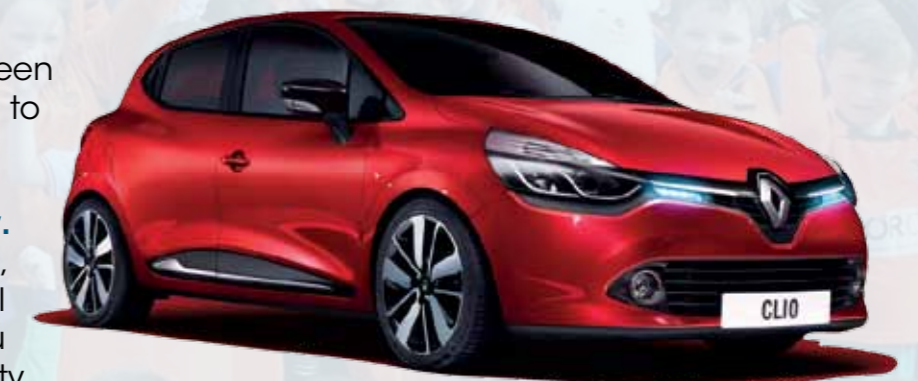
Bradley Renault Galway Associate Sponsor

ALSO please will you visit www.facebook.com/BFSPORTSFUND , like the page and share all the postings...and when you contribute tell all your community that you have supported the initiative.