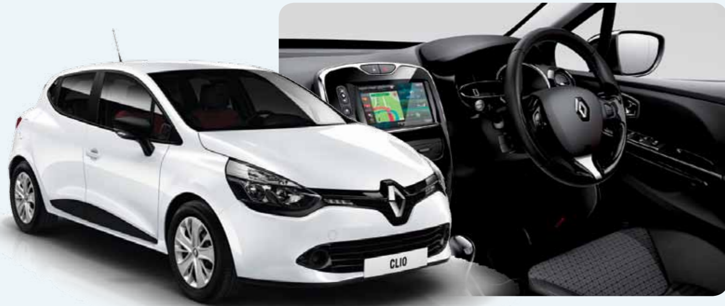
Bradley Renault Galway Associate Sponsor

Here are the magic numbers if you want to support this unique initiative and pledge a fiver a week or more via Standing Order. If it suits better to transfer the full amount that's fantastic also.